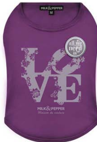
MP1068 - TS Love interlock 100% cotton - Col. Violet Print + Badge "All we need" SIZES : XS S M L XL XXL