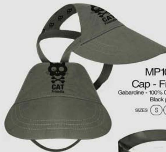
MP1077 Cap - Friendly Gabardine - 100% Cotton - Col Perle Black print SIZES (S) (M) (L)