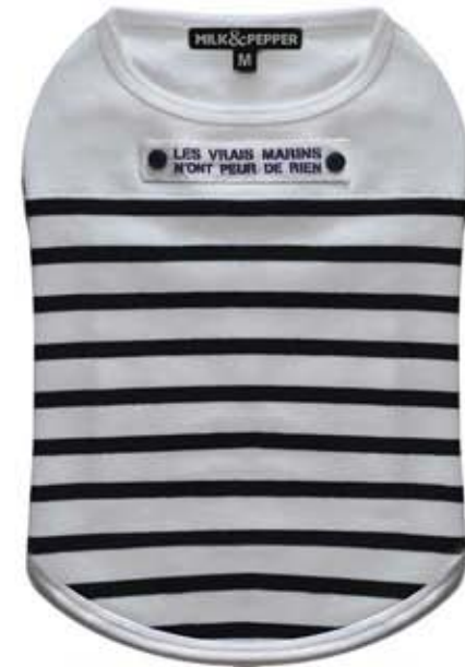
MP1070 - TS Matelot interlock 100% cotton - Col. Milk/Navy Label "les vrais marins n'ont peur de rien" SIZES : XS S M L XL XXL