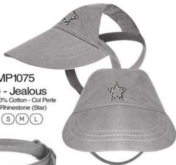
MP1075 Cap - Jealous Satin - 100% Cotton - Col Perle Silver Rhinestone (Star) SIZES (S) (M) (L)