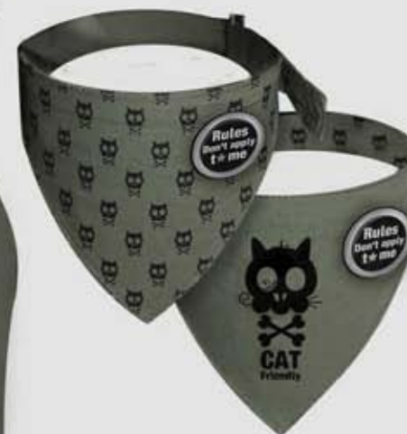
MP1076 Reversible scarf - Friendly Gabardine - 100% Cotton - Col Perle Black print + Bagde "Rules don't apply to me" SIZES (S) (M) (L)