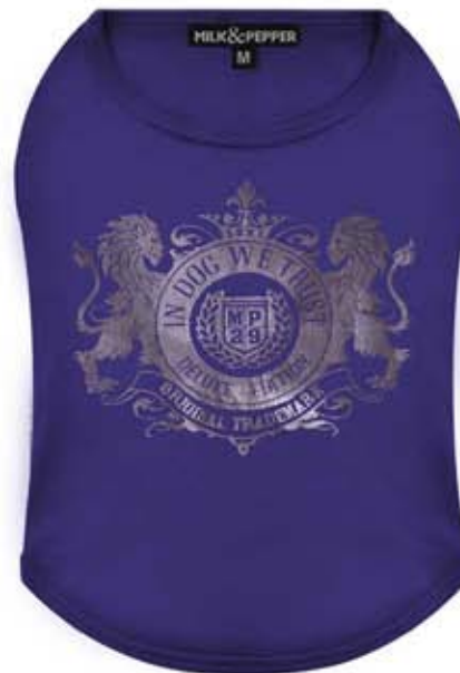
MP1072 - TS Blason interlock 100% cotton - Col. Hyacinth Vintage titan métal print. SIZES : XS S M L XL XXL