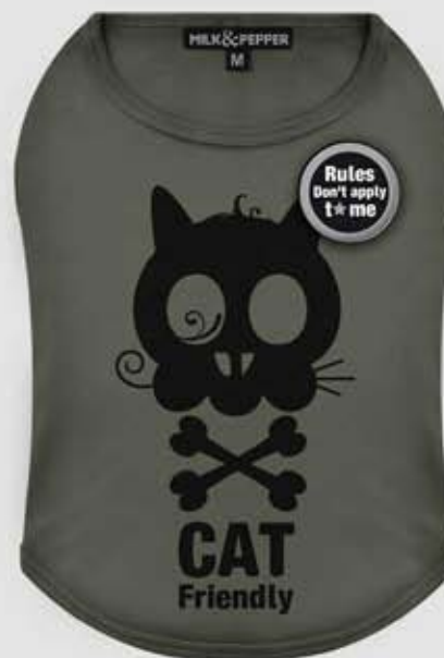
MP1071 - TS Friendly interlock 100% cotton - Col. Cactus Black print + Bagde "Rules don't apply to me" SIZES : (XS) (S) (M) (L) (XL) (XXL)