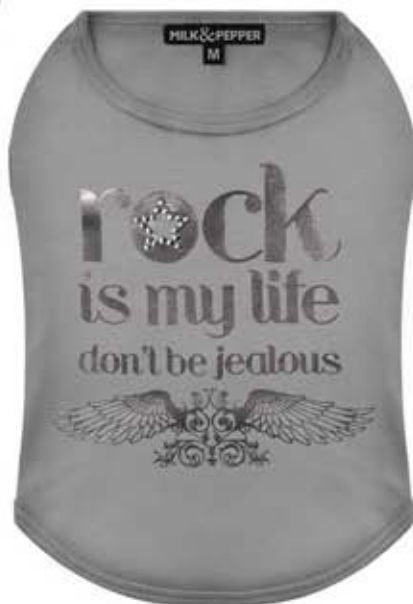
MP1067 - TS Jealous interlock 100% cotton - Col. Perle Silver Print + Silver Rhinestone (Star) SIZES : (XS) (S) (M) (L) (XL) (XXL)