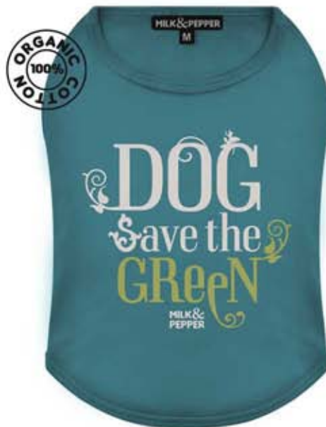
MP1069 - TS Green 100% ORGANIC / BIO cotton - Col. Lagoon Organic Pigment - Print SIZES : XS S M L XL XXL