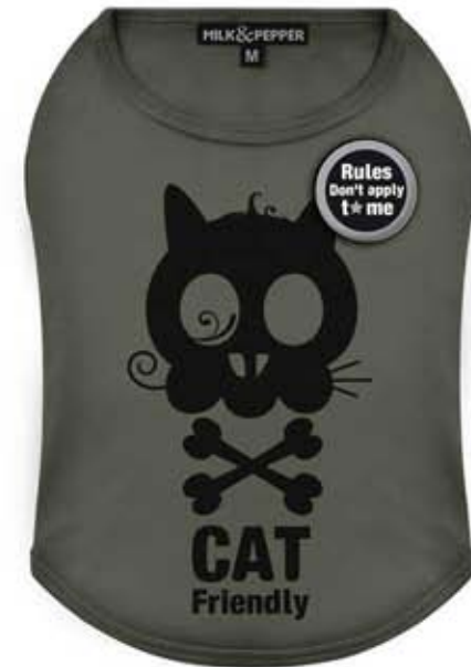
MP1071 - TS Friendly interlock 100% cotton - Col. Cactus Black print + Bagde "Rules don't apply to me" SIZES : XS S M L XL XXL