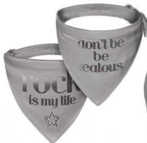
MP1074 Reversible scarf - Jealous Satin - 100% Cotton - Col Perle Silver Print + Silver Rhinestone (Star) SIZES (S) (M) (L)