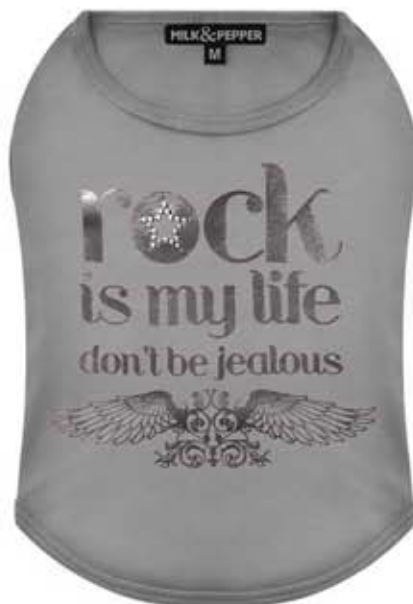
MP1067 - TS Jealous interlock 100% cotton - Col. Perle Silver Print + Silver Rhinestone (Star) SIZES : XS S M L XL XXL